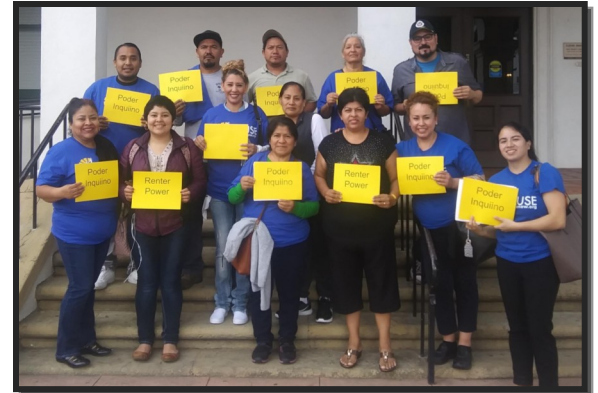
Voluntario Apartment Tenants Speaking Out at Santa Barbara City Council