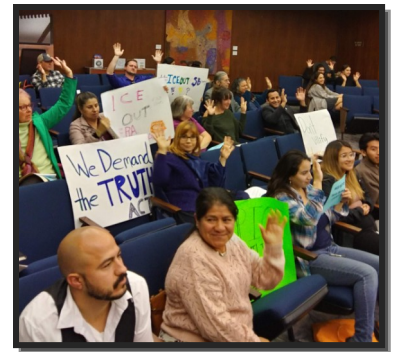
TRUTH Act Forum at Santa Barbara County Supervisors