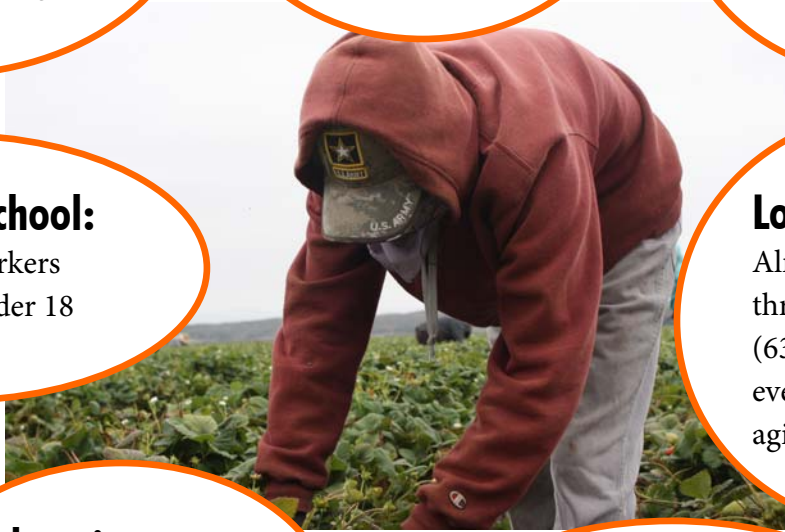
Educational Attainment of Farmworkers